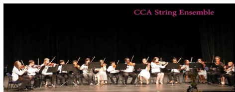
CCA String Ensemble