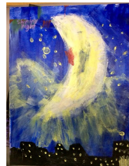
CCA Visual Art Program Student Artwork