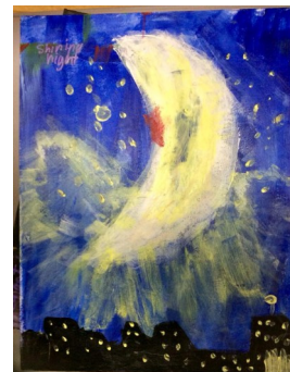
CCA Visual Art Program Student Artwork